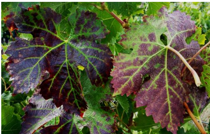
Symptoms of leafroll virus on Merlot